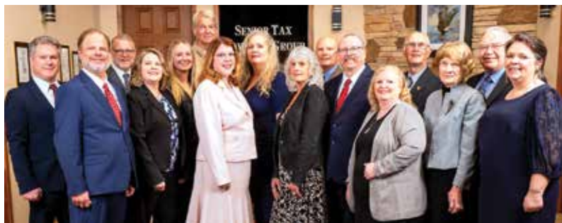
The dedicated team at Senior Tax Advisory Group